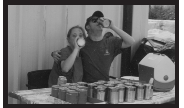
"No, No, No! The Mirage Food is for the CATS & DOGS!"

The first customer on board is Mirage Foods of San Diego, California. YEI! has been packaging metric tons of premier quality dog and cat food for Mirage Foods for years. When Mirage considered expansion into lot sales at the retail point, they turned longtime partners YEI! to perform the unique task of shrink-wrapping an entire case of product. This led to YEI!'s partnership with area Lion's Clubs to tool up for modern competitive production standards.